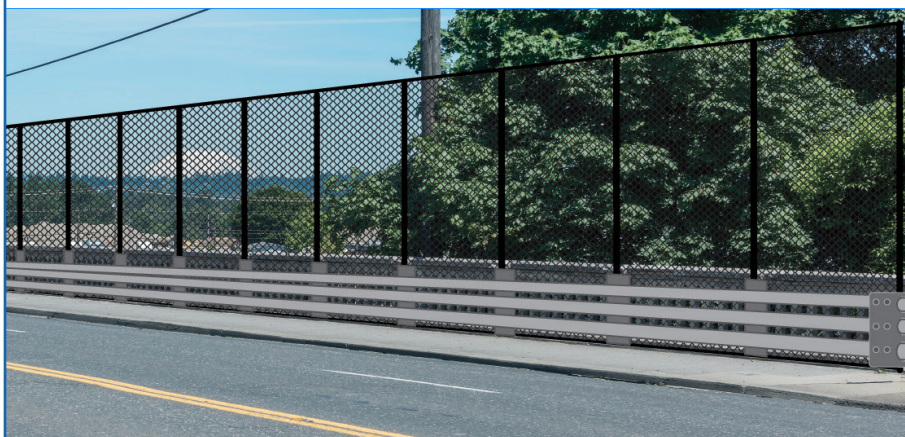
Top: The existing historic rail. Bottom: A rendering of the bridge with the additional rail and protective screening installed.